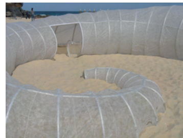
Journey through Vortex